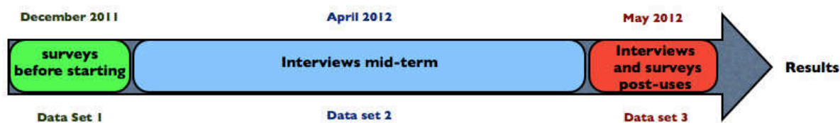
Figure 2 – Project timeline

All the interactions generated between the structures (research, teaching, administrative) will help to show the various processes involved in the use of LORFOLIO. Below are represented actors, actions and expected results.