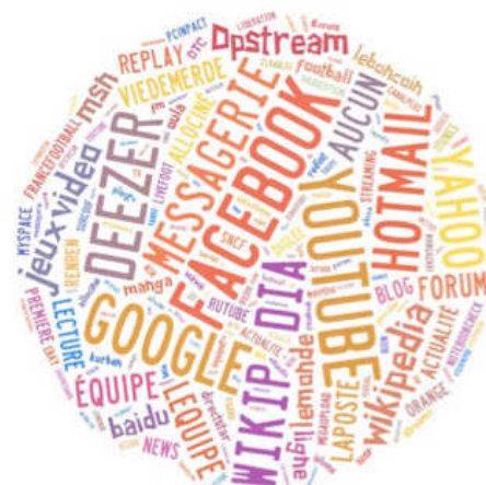
Figure 4 – Preferred websites

And marginally commercial, sport, news and entertainment websites.