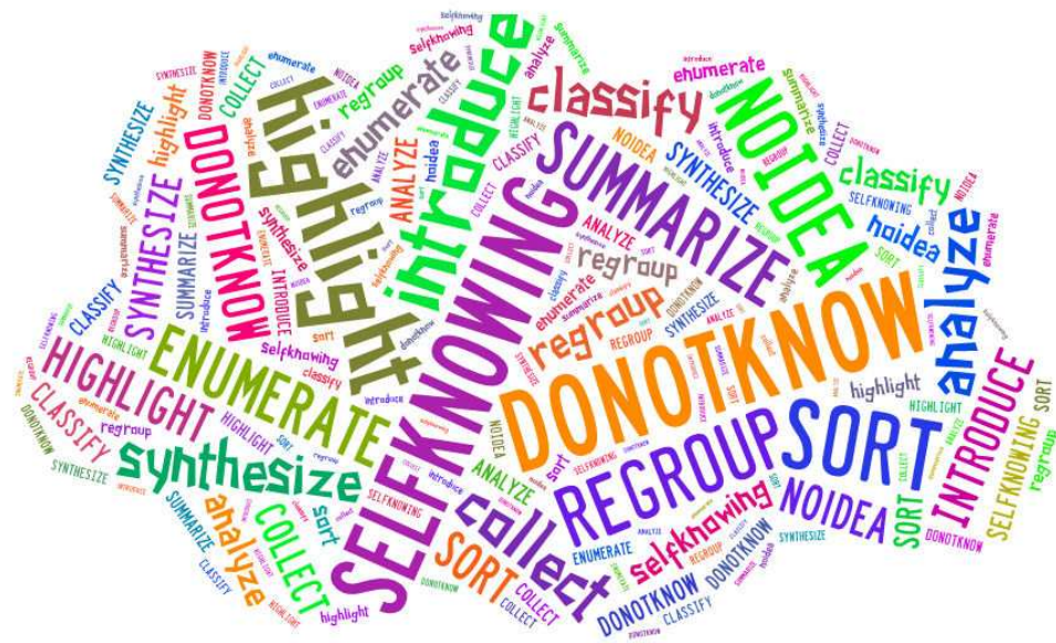
Figure 6 – Cited functionalities of an ePortfolio