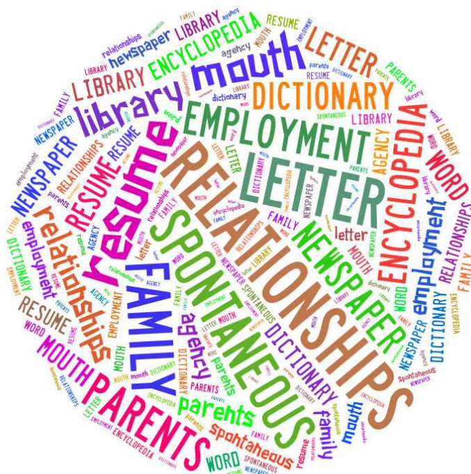
Figure 5 – Best ways to find a job

Relating to job search, the best way they think to find a job is to use relationship. The words most frequently cited are: