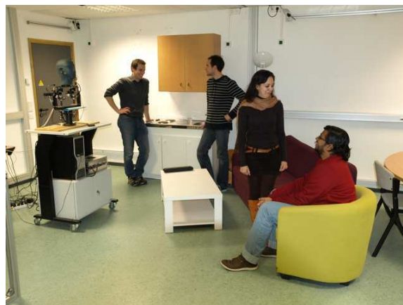
Figure 1: A cocktail party robot should be able to communicate with people in the most natural way. One fundamental task that such a robot should be able to accomplish is to localize the speakers in a room and to separate their emitted speech signals, all in the presence of music, background noise, and reverberations.

HRI'12, March 5–8, 2012, Boston, Massachusetts, USA. Copyright 2012 ACM 978-1-4503-1063-5/12/03 ...$10.00.