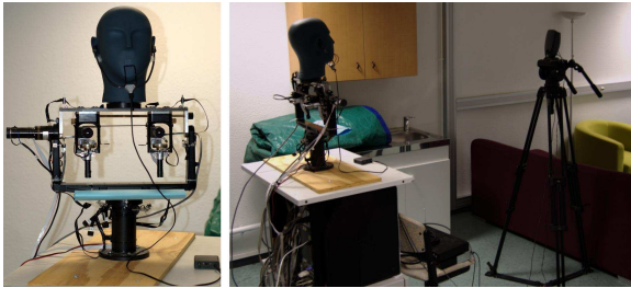
Figure 3: A binaural head is placed onto an agile device that can perform precise and reproducible pan and tilt motions (left). The emitter (a loud-speaker) is placed in front of the robot head at approximately 2.7 meters (right).

In order to build the training set introduced in section 3.1, we developed a technique to learn a large number of sound source locations in an entirely unsupervised and automated way using the motor system of a binaural robot head. This technique is initially inspired from the sensorimotor theories of early development in psychology, suggesting that experiencing the sensory consequences of voluntary motor actions was necessary for an organism to learn the perception of space [17]. In particular [3] argued that naive organisms such as humans and echo-locating bats could learn sound localization based solely on acoustic inputs and their relation to motor states. This idea was experimentally validated using a robot system in [8].