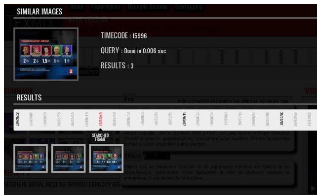
Illustration 2: Results of a search for similar images

Spoken language provides crucial information but so do images! Indeed, the same image is often used to illustrate a story throughout time. Based on our image retrieval technology [2], we included a 'similar image' search feature in the news portal, as illustrated Figure 2. In this second illustration, we search for images similar to a graphic depicting the voting intentions for the 2007 French presidential election. This results in similar graphics at different dates, making it possible to follow the evolution of the poll in time.