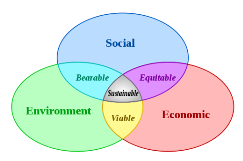
Fig. 2. The place for sustainability (picture from Wikipedia, built from [21]).

Ecological sustainability is oriented closely to the definition that relates to forestry, meaning trees should not be chopped down before others have reached the same height [24]. Ecological and social sustainability represents a visionary world order where the lifestyle of today's society incurs a penalty for future generations, and gives access to this lifestyle to all the society. It is more important to understand the effects of choosing a sustainable course of action than to categorize the action according to its motivation [25]. As already mentioned, there are different motivations for Green IT efforts but the result is more important than the original kind of motivation. It does not matter to the environment why I am saving electricity – to reduce my electricity bill or to have a pure conscience – but the environment benefits regardless.