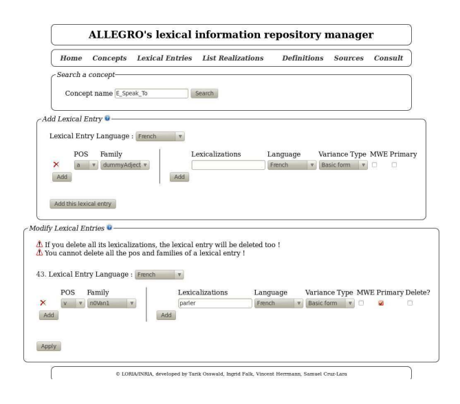
Figure 4: Screenshot of web interface for editing lexical entries.

Figure 3: Sample LIR lexical entries for a verb (a) and a noun (b).