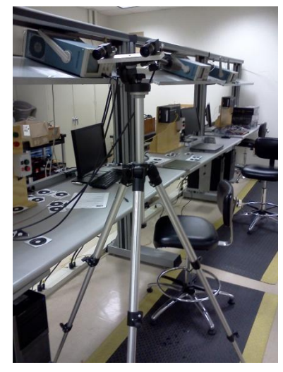
Figure 2: Camera System