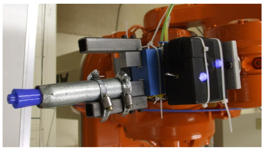
Figure 1: Close up of marker attachment