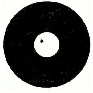
Figure 5: Marked fiducial

To provide a measure of accuracy, the robot end effector was equipped with a standard whiteboard marker. The marker was placed in a holding device that provides approximately 1cm of compliance along the axis of the marker (shown in Figure 3). Circular fiducials were placed in the workspace, and the robot was instructed to approach the center of the fiducial and stop 5mm above the fiducial (above corresponds to the Z axis) of the base frame of the robot.