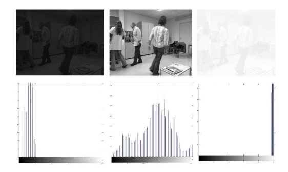
Figure 2: Illustration of Global changes in illumination. The image in the middle is the original image. The images at the left and right show peaked intensity version of the original image

Thus, to measure any illumination change completely both global and local changes have to be accounted for. In addition to this, the inherent complexity of the lighting intensity (peakedness of the histogram) should also be measured. The following procedure is followed to compute the final measure.