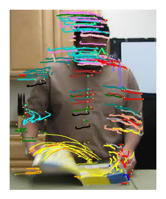
Messing et al., ICCV 2009