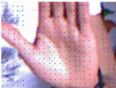
Figure 1. Scene flow projection onto the image

In the pyramidal decomposition points with unmeasured depth are propagated in the different levels increasing the effective area of the regions where scene flow can not be computed. Figure 1 shows the projection of the scene flow on a image region, where not computed values correspond to regions without enough depth information.