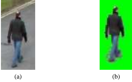
Figure 5: Input images to compute MRCG signature. (a) : original approach; (b) : our approach

tracklets (with at least 5 frames). When the tracklet is considered as finished by the short-term tracker, we compute its signature using the foreground images corresponding to a reliable enough detection ( C superior to a predefined threshold). Considering the current signature, we compute its distance with all the previously computed signatures using the distance defined in [2]. At any time, the global tracker has access to the current signatures and to the signatures that were lost.