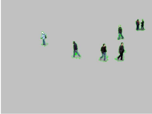
Figure 3: Foreground image with in green the contours

The background subtraction images are used as a mask to compute the foreground images (Fig. 3) and is used as an input of the global tracker.