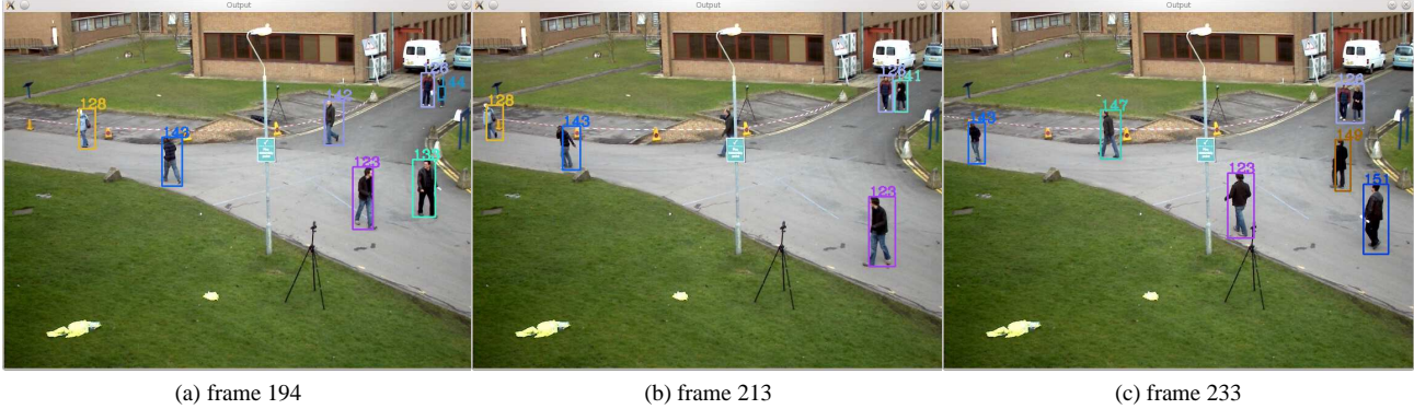
Figure 1: The global tracking challenge : correcting errors due to occlusions (ID 142 on the first frame becomes 147 on the last frame) and track people that are leaving the scene and reentering (ID 133 on the first frame becomes 151 on the last frame)

and for creating clusters of tracklets using an adaptive parameter that can be learned in a real-time situation (Section 2.5).