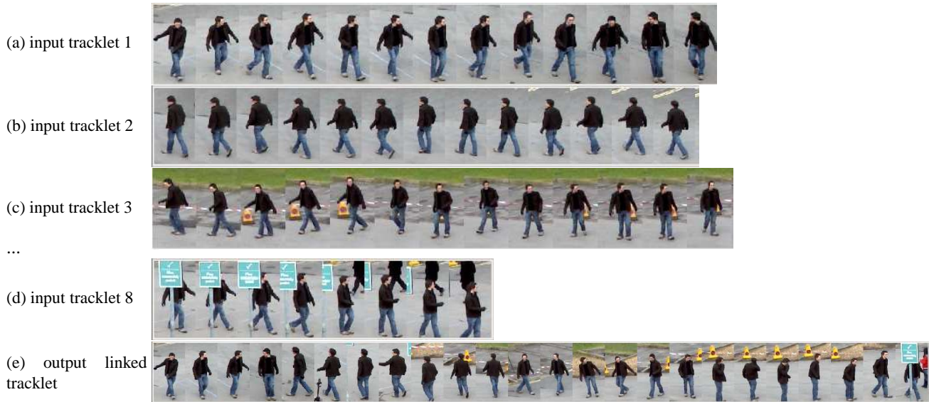
Figure 6: Linking algorithm inputs and output. The length of the output tracklet is the sum of the lengths of the inputs tracklets. In this example, the input tracklets length is between 8 and 120 frames and the output length is 348 frames.

are correctly linked, incorrectly linked and not linked according to the parameter q of the equation 3. A tracklet is considered as correctly linked if it is classified in a cluster representing the same person. An incorrect link occurs when the tracklet is put in a cluster representing a different person. Finally, not linked tracklets correspond to tracklets that are not assigned to any cluster whereas they should be. Our first results in Table 1 show the effectiveness of our approach on the first camera view (View_001), in the case when the 21 ground-truth trajectories are used as tracklets. Table 2 shows the results when the tracklets are computed with the short-term tracker.