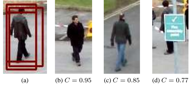
Figure 4: Confidence computation : (a) set of candidates for one person; (b) : a perfectly detected individual with a high confidence; (c) : an uncertain detection with an average confidence ; (d) : a bad detection with a low confidence due to occlusion.

This equation combines the LBP scores for human detection giving a highest priority to the best match. The higher the confidence, the more correct the person detection (Fig. 4).