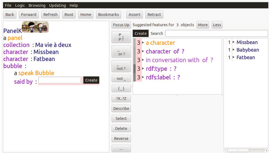
Fig. 2. Screenshot of Sewelis. On the left side, the description of the new object is shown, here panel K is a panel from the Ma vie à deux Collection, with Missbean and Fatbean as characters, it has a speech bubble said by someone. On the right side, suggested resources for the focus are listed, here the speakers.