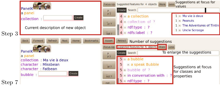
Fig. 8. UTILIS screen shots of steps 3 and 7 of PanelK creation