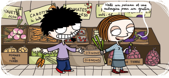
Fig. 6. Panel of Ma vie à deux : Pour le meilleur et pour le pire ! , by Missbean, City Editions

:collection [] . The upper part of Figure 8 shows the user interface for step 3, annotations in black have been made by hand, the current description is on the left side. On the right side, suggested resources for the focus are listed, here the collections. Above that area, the number of suggestions is indicated and a More button allows them to be expanded to larger distances containing results. At step 3, the user chooses <Ma vie à deux> among all the collections. Let us go back to Figure 7, at step 4 the description is <PanelK> a :panel; :collection <Ma vie à deux> . The suggestions are the properties of at least one panel of Ma vie à deux . The property selected by the user is :character [] to specify characters of the new panel. At step 5, the suggestions are all the characters of the Ma vie à deux panels already annotated. The user selects <Missbean> and <Fatbean> . At step 6, the initial query, corresponding to the description, has no results. Indeed, those two characters do not appear together in any panel of the base yet. By relaxation, UTILIS makes suggestions to the user at distances 1 and 7. The lower part of Figure 8 shows the user interface of step 7, suggested classes and properties are in the middle part. From there on, the user can continue the description of the panel and when he decides that it is complete, he adds it to the base with the Assert button.