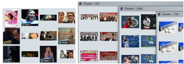
Figure 1: (left) A pruned noisy cluster, (right) top-3 selected clusters for the first week of Sept 2011 (presidential primary, USOpen, mediator scandal)

A front-end GUI built on top of the system allows browsing the image of the day , the image of the week or the image of the month thanks to an interactive timeline. Snapshots of the GUI are presented in Figure 4. The image of each period (day, week or month) and the associated description and keywords were computed as follows: (i) our clustering & contextual reranking method is applied to the visual matching graph restricted to the respective period (ii) only the top-1 cluster (according to the diversity score) is kept (iii) the most frequent keywords in the cluster's metadata are computed (iv) we then choose the image of the cluster hav-