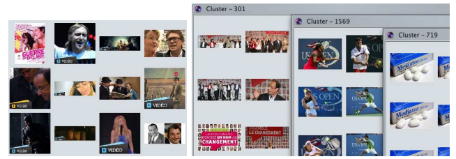
Figure 1: (left) A pruned noisy cluster, (right) top-3 selected clusters for the first week of Sept 2011 (presidential primary, USOpen, mediator scandal)

A front-end GUI built on top of the system allows browsing the image of the day , the image of the week or the image of the month thanks to an interactive timeline. Snapshots of the GUI are presented in Figure 4. The image of each period (day, week or month) and the associated description and keywords were computed as follows: (i) our clustering & contextual reranking method is applied to the visual matching graph restricted to the respective period (ii) only the top-1 cluster (according to the diversity score) is kept (iii) the most frequent keywords in the cluster's metadata are computed (iv) we then choose the image of the cluster hav-