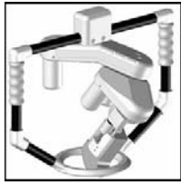
Fig. 2: 4 DOF PROSIT-0 prototype, the prismatic z axis carries the ultrasound probe and maintains it in contact with the patient's skin and is based on the PRISME patent [10]

using the passivity of the wave variables properties of [9,10].