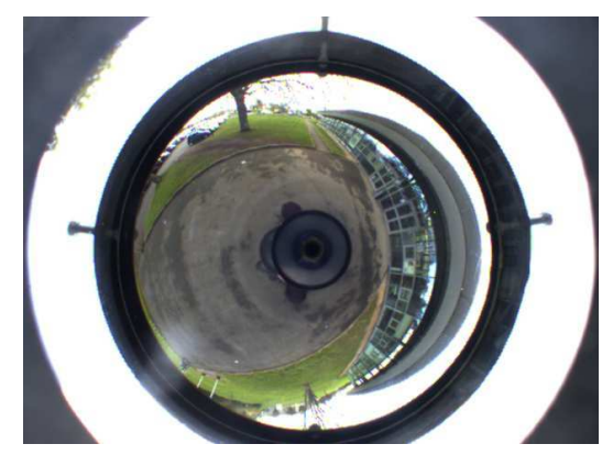
Figure 3: image provided by the Catadioptric system.

For the first projection, the mathematical formulation of the problem consists in mapping all the space directions onto a plane. Mapping one direction of the 3D space is equivalent to map a point from a unit sphere onto a plane [10]. This mapping problem (and its inverse problem) has been widely studied by mathematicians and cartographers [11]. We use the plate carrée cylindrical projection [11] (aka. the equirectangular projection) that is widely used both in cartography and panoramic imaging. Although the plate carrée projection generates some distortions at poles, it preserves the shapes along the 0° parallel. This is known