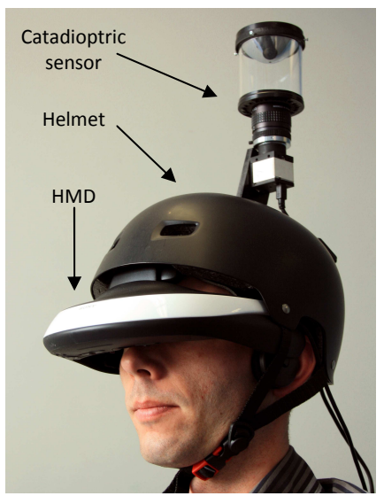
Figure 1: FlyVIZ prototype and proof-of-concept.

Copyright 2012 ACM 978-1-4503-1469-5/12/12...$15.00.