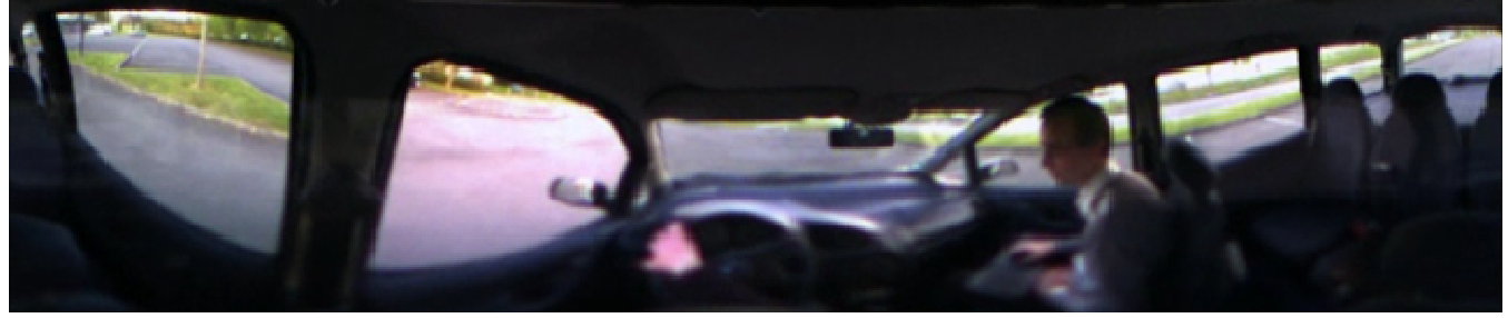
Figure 5: Third illustrative scenario: driving a car on a parking lot (HMD view).

The main discomfort came from the unbalanced weight of the headset (helmet, camera, optics and HMD: 1650g). Future work is of course necessary now to evaluate the learning process, user perception, and the potential exploitation of 360^{\circ} vision in various tasks, which is not the focus of this paper.