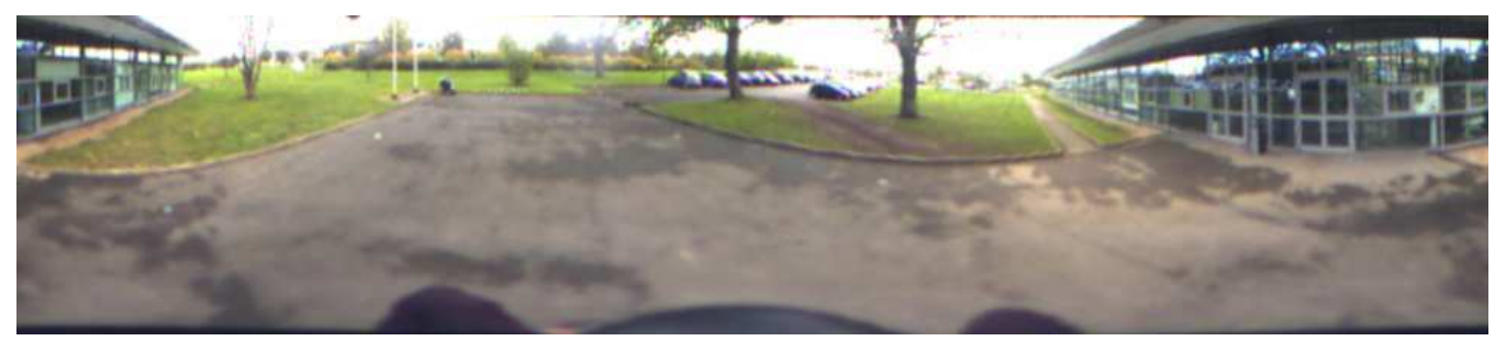
Figure 4: Image displayed in the HMD corresponding to the transformation of the raw image of Figure 3.

During these tests, users get used within the first 15 minutes of practice, letting them to smoothly move in their environment. Users also get used to the new visual feedback loop of their arms and hands, letting them open doors or grasp objects. In these cases, depth perception is altered since binocular vision is not available, but as suggested by Cutting [13], users seem to be able to base depth evaluation on the other depth cues (motion parallaxes, etc.). For the main user, a first scenario consists in grasping an object (a stick) held out by another person. Without moving his/her head, the user instantly perceives the position of the stick and can grab it, even when it is located out of his/her natural field of view. In a second scenario, the user is walking and must avoid some balls thrown at him/her, with balls sometimes being thrown from behind. A third scenario consists in driving a car on a parking lot, being able to see both the external environment and the car interior at the same time (Figure 5). During several tests, the device has been worn for more than an hour, without motion sickness or particular visual fatigue.