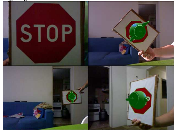
Figure 1: Augmentation of a traffic sign (top left) under different poses using DARC.

Figure 1 shows some results obtained with DARC for detection and pose estimation of different planar objects. It can be seen that DARC can deal with significant changes in rotation and scale as well as with perspective distortions. The contour groups used as templates are the octagon of the stop sign together with its inner contours, the continent frontier of the map and the outer square of the logo together with its inner contours.