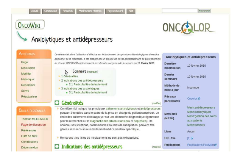
Fig. 1. An excerpt of guideline in the wiki.

JavaScript functions were removed. A parser was also used to transform HTML into wikitext when simple tags were detected (images, tables, etc.). Moreover, by using a parser and context analysis, specific fields were identified. The objective was to identify interesting information about a guideline such as the date of its last update or keywords. Moreover, by examining website folder structure, an anatomical classification of the guideline has been identify. This classification was reused as a base for guideline categorisation in the wiki.