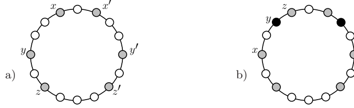
Fig. 1. a) The intervals between robots y , z and y' , z' are the supermins, while the supermin configuration view is (1, 2, 1, 2, 1, 3) . b) Black nodes represent multiplicities.

by robots when traversing the ring in one direction, starting from r . Abusing the notation, for any 0 \leq i \leq j , we refer by q_i not only to the length of the i -th interval but also to the interval itself. Unless differently specified, we refer to Q(r) as the lexicographical minimum view among the two possibilities. For instance, in the configuration of Fig. 1a, we have that Q(x) = (1, 2, 1, 3, 1, 2) . A multiplicity is represented as q_i = -1 for some 0 \leq i \leq j , regardless the number of robots in the multiplicity. For instance, in the configuration of Fig. 1b, Q(x) = (1, -1, 0, 1, 0, -1, 1, 1, 3, 1) . Given a generic configuration C = (q_0, q_1, \dots, q_j) , let \bar{C} = (q_0, q_j, q_{j-1}, \dots, q_1) , and let C_i be the configuration obtained by reading C starting from q_i , that is C_i = (q_i, q_{(i+1) \bmod j+1}, \dots, q_{(i+j) \bmod j+1}) . The above definitions imply: