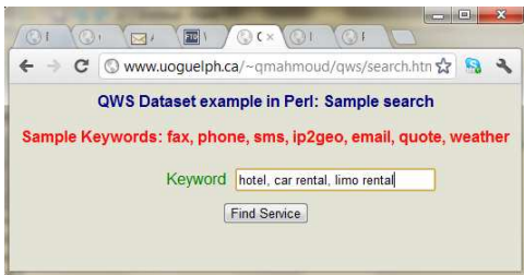
(a) Scoping phase.

quality model consists of 10 quality properties among which we have response time (RT), availability (AV), throughput (TH), reliability (RL), etc.