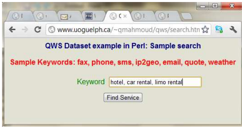
(a) Scoping phase.

quality model consists of 10 quality properties among which we have response time (RT), availability (AV), throughput (TH), reliability (RL), etc.