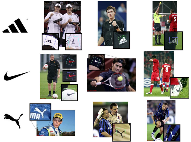
Figure 5: Examples of detections output by our system for the 3 queries on the left.

Compared to the state of the art, our approach outperforms the a-contrario query expansion of Joly et al. [7] by 7% on Qset1 and 22% on Qset2. In contrast to this method, our approach does not add any overhead at run-time and could, in fact, be combined with query expansion. On the FlickrLogos dataset, we outperform the method of [16] by 12%. Contrary to the cascaded triplets features of [16], our approach remains generic and can be added to existing BoW-based systems.