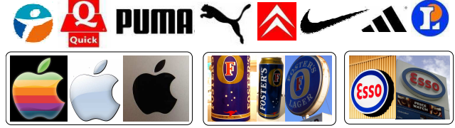
Figure 4: Sample logos from BelgaLogos (set #2) [7] (top row) and from Flickr-Logos [16] (bottom row).

real-world images: the BelgaLogos [7] and the FlickrLogos [16] datasets.