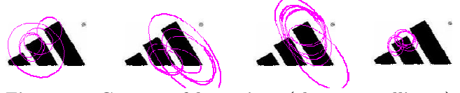
Figure 3: Groups of keypoints (shown as ellipses) obtained after correlation-based clustering (section 3.3).

This scoring criterion is widely used in RANSAC implementations [2, 7, 15].