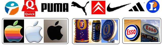
Figure 4: Sample logos from BelgaLogos (set #2) [7] (top row) and from Flickr-Logos [16] (bottom row).

real-world images: the BelgaLogos [7] and the FlickrLogos [16] datasets.