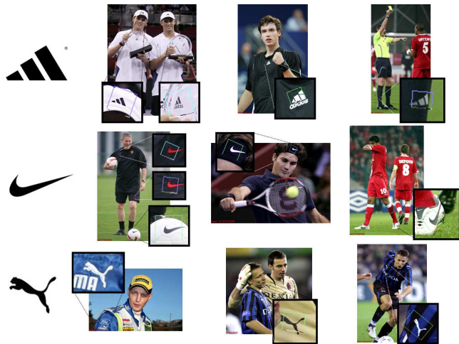
Figure 5: Examples of detections output by our system for the 3 queries on the left.

Compared to the state of the art, our approach outperforms the a-contrario query expansion of Joly et al. [7] by 7% on Qset1 and 22% on Qset2. In contrast to this method, our approach does not add any overhead at run-time and could, in fact, be combined with query expansion. On the FlickrLogos dataset, we outperform the method of [16] by 12%. Contrary to the cascaded triplets features of [16], our approach remains generic and can be added to existing BoW-based systems.