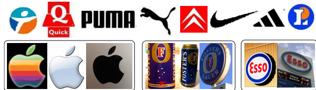
Figure 4: Sample logos from BelgaLogos (set #2) [7] (top row) and from Flickr-Logos [16] (bottom row).

real-world images: the BelgaLogos [7] and the FlickrLogos [16] datasets.