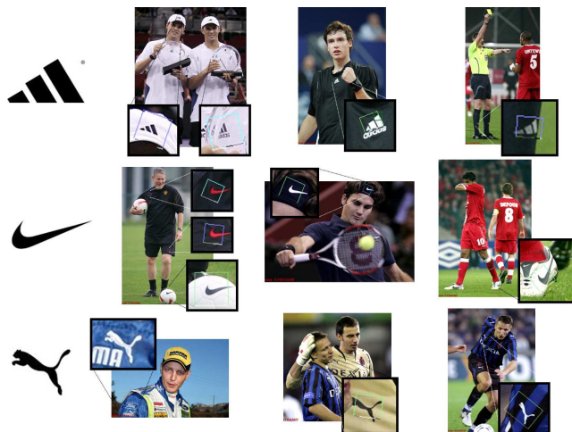
Figure 5: Examples of detections output by our system for the 3 queries on the left.

Compared to the state of the art, our approach outperforms the a-contrario query expansion of Joly et al. [7] by 7% on Qset1 and 22% on Qset2. In contrast to this method, our approach does not add any overhead at run-time and could, in fact, be combined with query expansion. On the FlickrLogos dataset, we outperform the method of [16] by 12%. Contrary to the cascaded triplets features of [16], our approach remains generic and can be added to existing BoW-based systems.