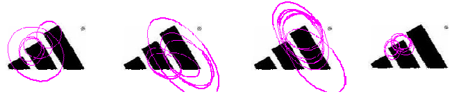
Figure 3: Groups of keypoints (shown as ellipses) obtained after correlation-based clustering (section 3.3).

This scoring criterion is widely used in RANSAC implementations [2, 7, 15].