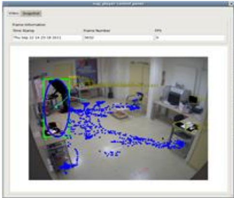
Figure 2. Multi-sensor activity recognition system screen. Rectangle envelope highlights the detection of a person in the scene. Blue dots represent previous positions of the detected person in the scene.

The vision component has been developed using a modular vision platform locally developed that allows the test of different algorithms for each step of the computer vision chain (e.g., video acquisition, image segmentation, physical objects detection, physical objects tracking, actor identification, and actor events detection). The vision component extracts the objects to track from the current frame using an extension of the Gaussian Mixture Model algorithm for background subtraction [26]. People tracking is performed by a multi-feature tracking algorithm presented in [20], using the following features: 2D size, 3D displacement, color histogram, and dominant color. Fig. 2 shows an example of the vision component output. Rectangle envelope highlights the detection of a person in the scene. Blue dots represent previous positions of the detected person in the scene.