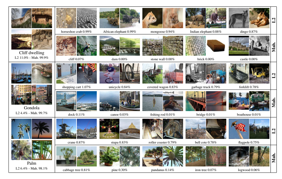
Fig. 1. The nearest classes for three reference classes using the the \ell_2 and Mahalanobis metric learned for the NCM classifier. Class probabilities are given for a simulated image signature that equals the mean of the reference class, see Section 4.3 for details.

learned, we can learn the 10K classifiers ( i.e. compute their means) on 64K dimensional features in less than an hour on a single CPU, while learning one-vs-rest linear SVMs on the same data takes on the order of 280 CPU days. Finally, we explore a zero-shot setting where the class mean of novel classes are estimated based on related classes in the ImageNet hierarchy. We show that the zero-shot class mean can be effectively combined with the empirical mean of a small number of training images. This provides an approach that smoothly transitions from settings without training data to ones with abundant training data.