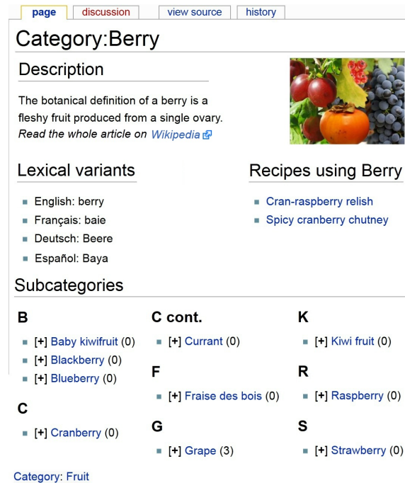
Figure 2. The Berry concept in WIKITAAABLE.

WIKITAAABLE is a semantic wiki that uses Semantic MediaWiki [11] as support for encoding knowledge associated to wiki pages. WIKITAAABLE contains the set of resources required by the TAAABLE reasoning system, in particular: an ontology of the domain of cooking, and recipes.