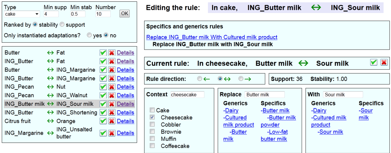
Figure 5. Expert validation interface.

The details of a AK are displayed on the third part of the interface, on the right-hand side. On this frame, the expert can make modifications in order to adapt the proposed AK.