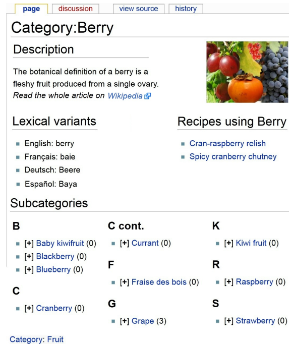
Figure 2. The Berry concept in WIKITAAABLE.

WIKITAAABLE is a semantic wiki that uses Semantic MediaWiki [11] as support for encoding knowledge associated to wiki pages. WIKITAAABLE contains the set of resources required by the TAAABLE reasoning system, in particular: an ontology of the domain of cooking, and recipes.