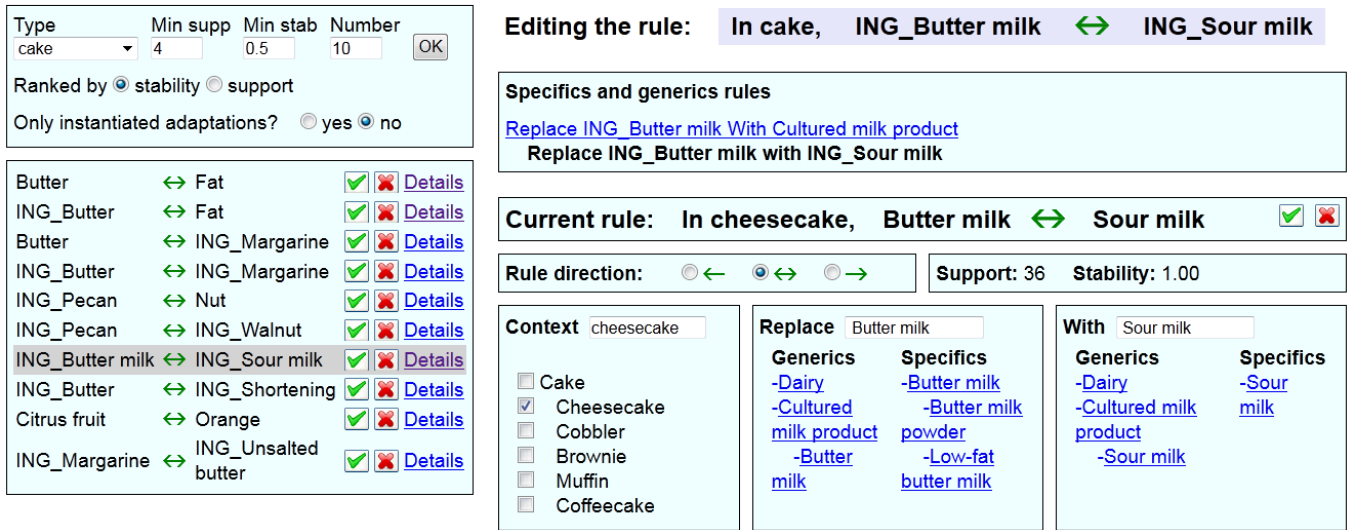
Figure 5. Expert validation interface.

The details of a AK are displayed on the third part of the interface, on the right-hand side. On this frame, the expert can make modifications in order to adapt the proposed AK.