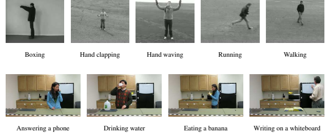
Figure 2: Sample frames from video sequences of the KTH (first row) and ADL (second row) datasets.

In order to quantize local features, we use the k -means clustering technique and nearest neighbour algorithm. To compute the bag-of-words representation, features are quantized to the codebook size of 1000, which has shown empirically to give good results. As a metric to calculate a distance between features and visual words, we use the L_2 norm. Since Harris3D corner detector calculates sparse spatio-temporal features, we set the weights w as w^{(x)} = 1 , w^{(y)} = 2 , w^{(t)} = 4 (Equation 5). To compute STOCF features, the HOG-HOF descriptors are quantized to small codebook sizes (10, 15, 20 and 25) and