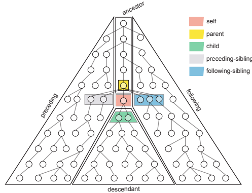
Figure 4: Tree Navigation

We then observe that \psi contains 24 atomic propositions, 38 modalities, 23 conjunctions, and 8 disjunctions (including duplicates). The size of the lean is only 18 (14 modalities and 4 atomic propositions.) 2 Each new split(_) around the formula then only adds two elements to the lean.