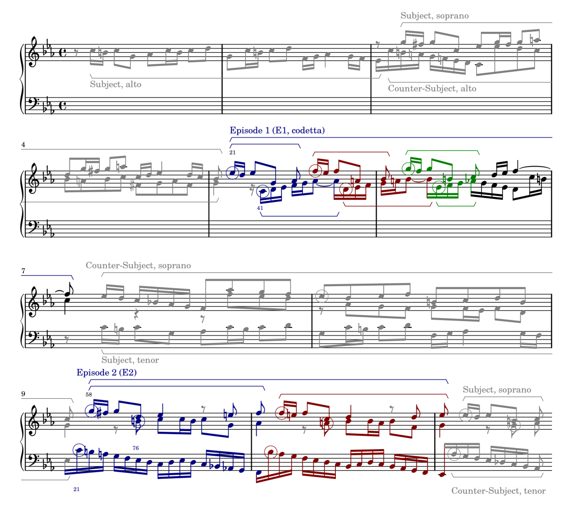
Figure 4 . Start of Fugue #2 in C minor (BWV 847), showing the ground truth for the first two episodes. Non-episodic parts are grayed. The notes starting the initial patterns and the occurrences of the sequences are circled.