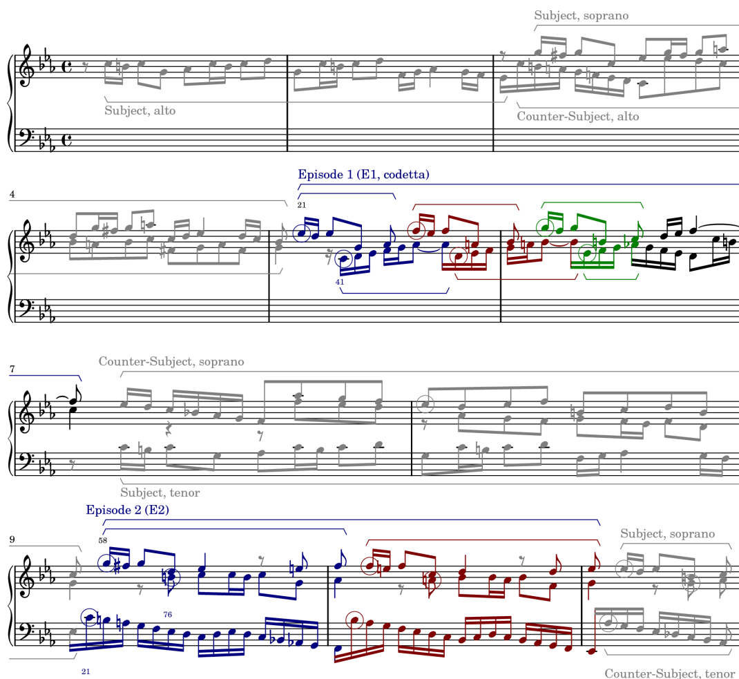
Figure 4. Start of Fugue #2 in C minor (BWV 847), showing the ground truth for the first two episodes. Non-episodic parts are grayed. The notes starting the initial patterns and the occurrences of the sequences are circled.