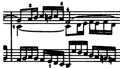
Figure 5. Partial sequence with a change of voices: the pattern is heard at the soprano, then, transposed, at the alto (measure 24 of Fugue #2).