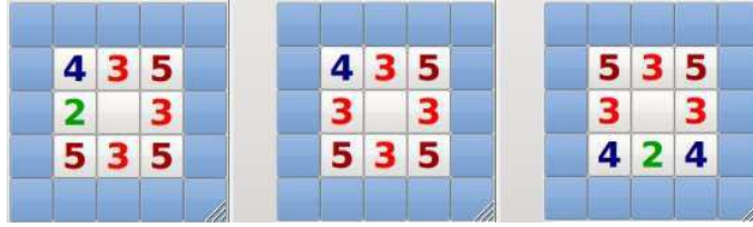
Fig. 3. The Gnomine version of the 5x5 board with 15 mines is a sure win: on each of these figures, one can deduce the position of all mines (there is only one non-mine location). This covers all possible cases by rotation.

Given the rules only (no expert knowledge added), our algorithm asymptotically finds the best move, and in 5x5 with 15 mines and gnomine rules it finds it in 5 seconds (in all runs among 500 runs).