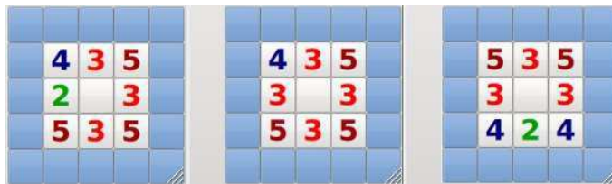
Fig. 3. The Gnomine version of the 5x5 board with 15 mines is a sure win: on each of these figures, one can deduce the position of all mines (there is only one non-mine location). This covers all possible cases by rotation.

Given the rules only (no expert knowledge added), our algorithm asymptotically finds the best move, and in 5x5 with 15 mines and gnomine rules it finds it in 5 seconds (in all runs among 500 runs).