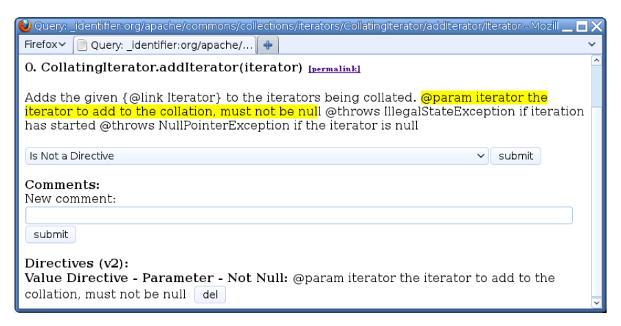
Figure 1: Searching, reading, and identifying directives is supported with an ad hoc browser-based tool

Note that we also permitted tagging directives that were found through serendipity: for instance tagging the next sentence of a pattern occurrence or even tagging directives found with free search over the API documentation database.