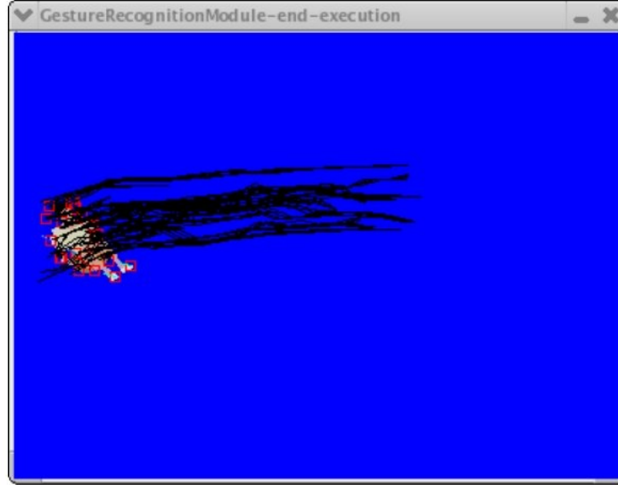
Figure 2: Synthetic data-set: Red rectangles represent the tracked descriptors and the lines represent their trajectories.