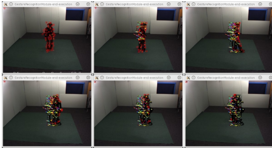
(b) Output of the proposed tracker with long term motion: different colors indicate different motion directions