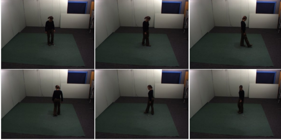
Figure 4: Frames from the IXMAS database illustrating a turn-around action.