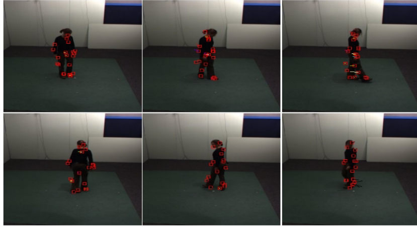
(a) Output of the proposed tracker with short term motion: only few descriptors and their correspondent motions are displayed.