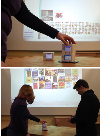
Figure 2: Stackables are small tangibles for faceted browsing that can be used alone or together with others.

in the selection process. Faceted browsing can help decision makers: they can consider data from different conceptual dimensions and incrementally refine a dataset by restricting facet values such as price, technical attributes, or ratings (e.g., [4, 7]).