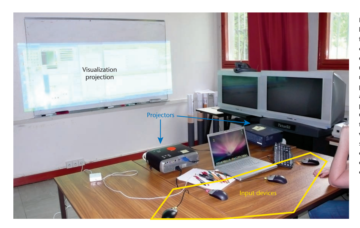
Figure 1. A low-cost setup for colocated collaborative data analysis using four mice, two projectors, and a wall for projection. Our goal was to determine whether such a setup could support effective collaboration.

CoCoNutTrix (Colocated Collaborative NodeTrix). Then, we assessed how analysts viewed CoCoNut-Trix and whether it effectively supported collaborative data analysis among domain experts using real data sets for social-network analysis. Our goal is to refine and expand our knowledge about retrofitting and hence designing colocated collaborativevisualization systems.