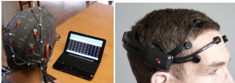
Left: IntendiX running on a laptop and user wearing the active electrodes. Right: dry EEG technologies by Emotiv.

Due to the recent advances and increased interest in BCI technologies, several companies are now commercializing BCI products. Such products range from high quality and expensive systems for scientists and medical applications, to cheap low-end devices for the general public. Among them, we can mention the IntendiX® (g.tec medical engineering GmbH, Austria, www.intendix.com ), which is a complete BCI solution for spelling dedicated to patients at home. At the other end of the spectrum, we can mention the BCI devices provided by Neurosky ( www.neurosky.com ) or Emotiv ( www.emotiv.com ). Those companies provide cheap dry sensors technologies together with dedicated software, mostly for gaming applications. It should be mentioned, however, that due to the sensors location in those systems, they most likely also measure and use muscle activity (ElectroMyoGram – EMG) and thus might not be considered a pure BCI (see, e.g., http://spectrum.ieee.org/consumer-electronics/gaming/loser-mental-block/0 ). Independently from this definition, from an application point of view, using EMG together with EEG signals could prove useful and rewarding.