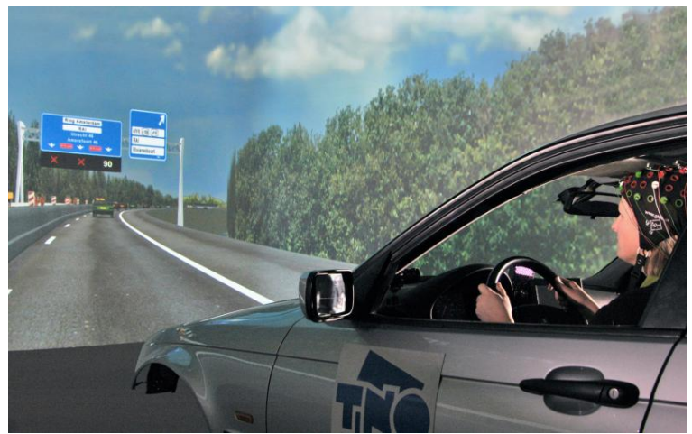
Fig. 3. Brain signals can be used to monitor for instance driver workload or to evaluate in-vehicle systems that may interfere with the primary driving task.