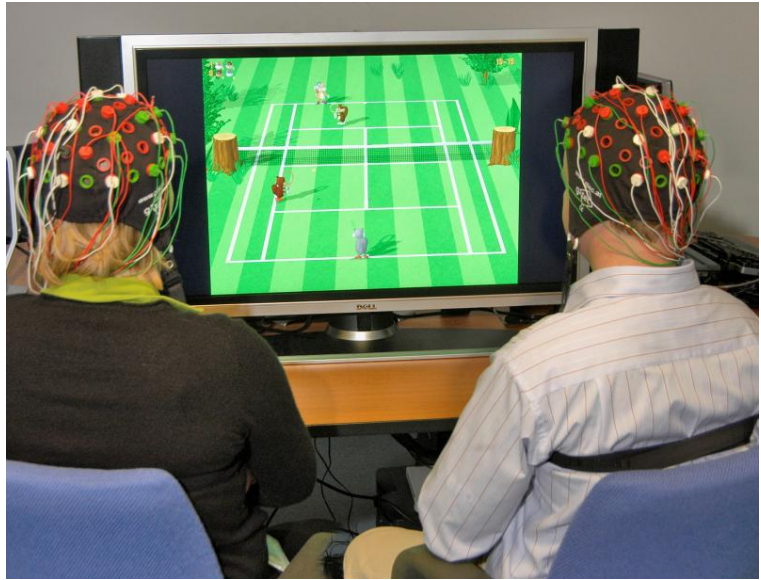
Fig. 2. Gaming is considered an important application area of non-medical BCIs. Brain control results in the development of new games but can also add to the fun factor of existing games.