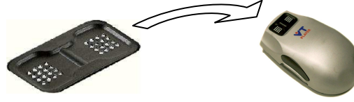
Fig. 1. VTPlayer mouse, with two 4×4 pins matrices on the top