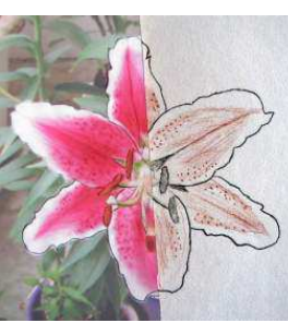
(a) Scene manipulation