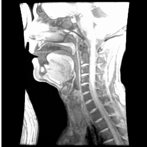
Figure 1: Cutaway volume rendering of raw volumetric data for [a].