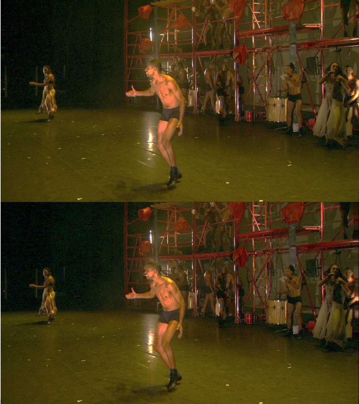
Figure 3. Left view mapped to the synthesized view (top), right view mapped to the synthesized view (bottom).