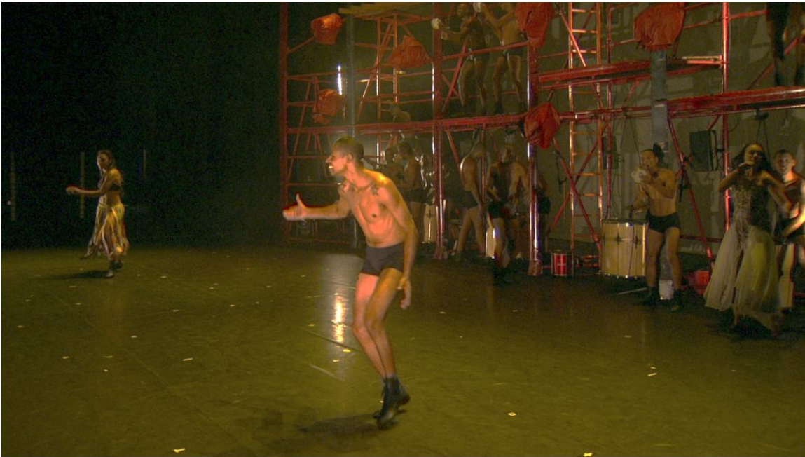
Figure 4. New composed view with depth-preserving synthesis method.

Another subject of interest is to detect which shots can be left untouched (so that artifacts caused by view synthesis can be avoided completely), based on the amount of divergence and on the global amount of depth distortions caused by viewing the unmodified shot.