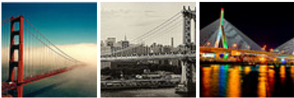
(c) bridge + sea + sky