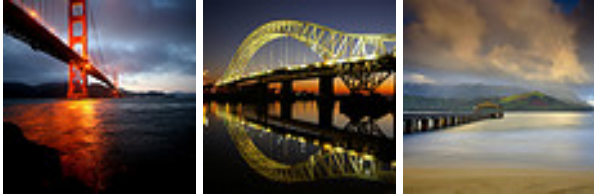
(b) bridge + sea