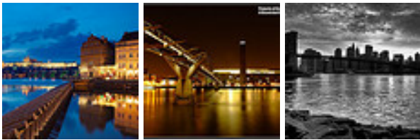
(d) bridge + sea + sky + building