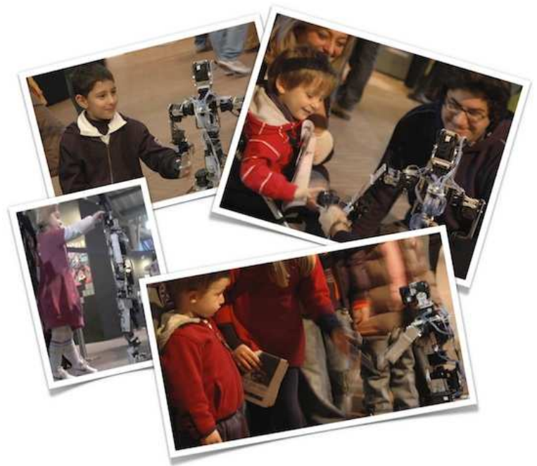
Fig. 1. Robust and playful physical child-robot interaction with Acroban. Around 150 children personally and continuously interacted with Acroban during a whole week-end in a public space in Citta della Scienza, Napoli, Italy.

http://www.youtube.com/watch?v=gKEjkckxzBU