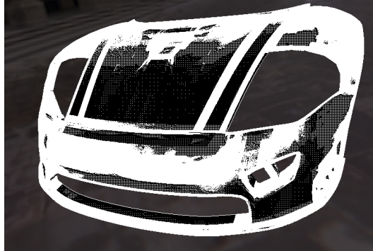
(d) Pixels actually computed