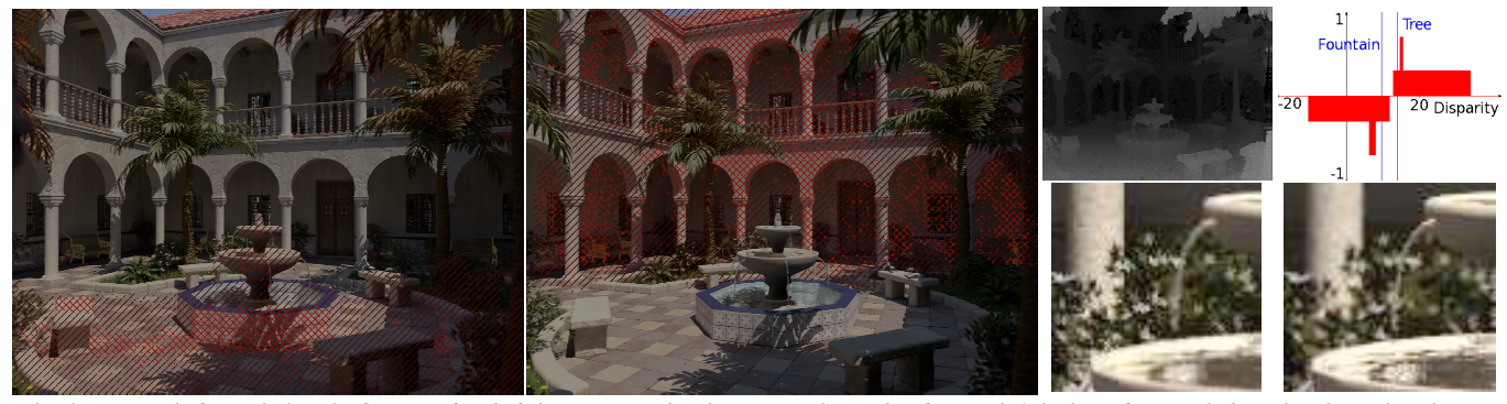
Fig 1: From left to right: 1. Output for left image. Red zebra area (e.g. the fountain) is less focused than in the other image. 2. Output for right image. 3. Left-Right disparity map. 4. Optimized focus difference curve. 5. Left image detail: flowers in focus, fountain out of focus. 6. Right image detail: flowers out of focus, fountain in focus.

Inria Grenoble - Rhône Alpes, France, sergi.pujades@inrialpes.fr