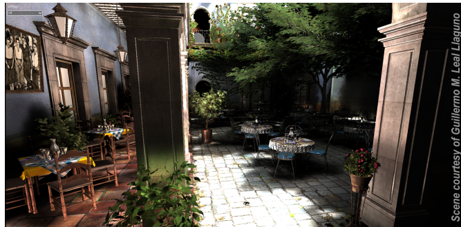
Figure 1: Real-time indirect illumination (25-70 fps on a GTX480): Our approach supports diffuse and glossy light bounces on complex scenes. We rely on a voxel-based hierarchical structure to ensure efficient integration of 2-bounce illumination. (Right scene courtesy of G. M. Leal Llaguno)