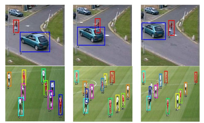
Figure 2: Partial and full occlusion management

The improvements of our feature detection and selection approach are illustrated in Figure 2.