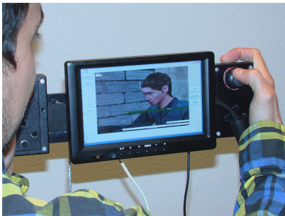
Figure 1: Our hand-held virtual camera device with custom-built dual handgrip rig and button controls, a 7-inch LCD touch-screen.